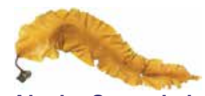
Alaska Sugar kelp Saccharina latissima